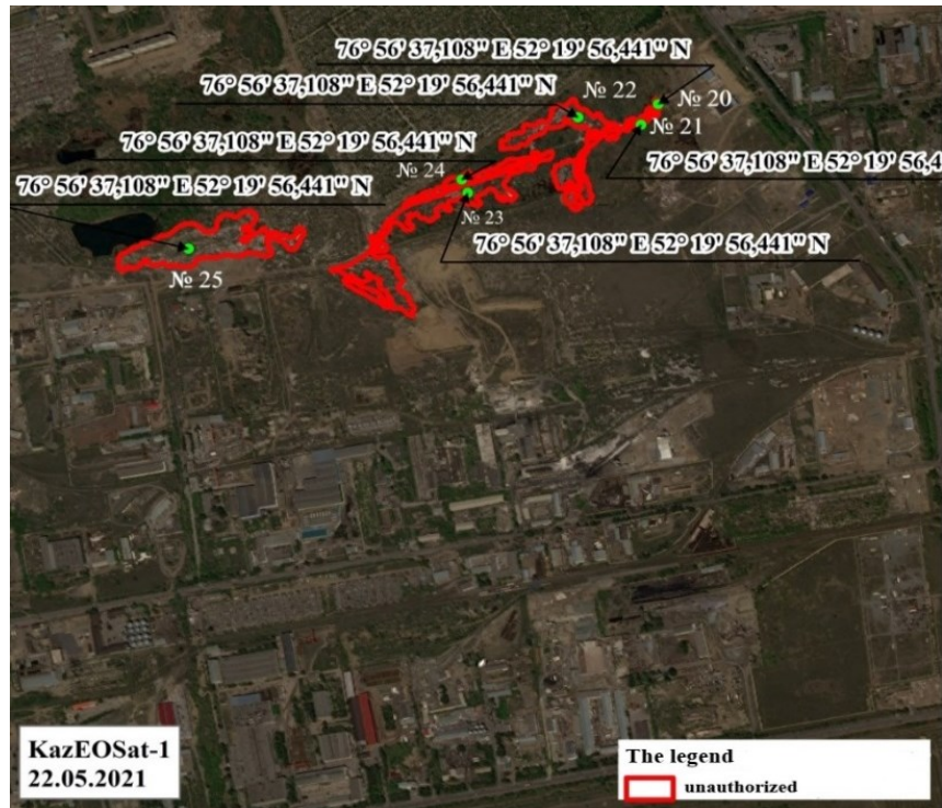
Figure 3. Emergency landfills covering a large area in the eastern part of Pavlodar