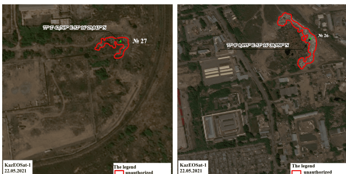
Figure 5. Space image of emergency landfills in a small area at east of Pavlodar city

One of the places of people's mass gathering in Pavlodar at a distance of 650 m outside the shopping and entertainment center «Batyrmall» installed an unauthorized landfill № 26, the area of which is about 14,600 m 2 . Landfill № 27, which occupies a small area in the extreme region of Pavlodar, was also identified (Figure 5).