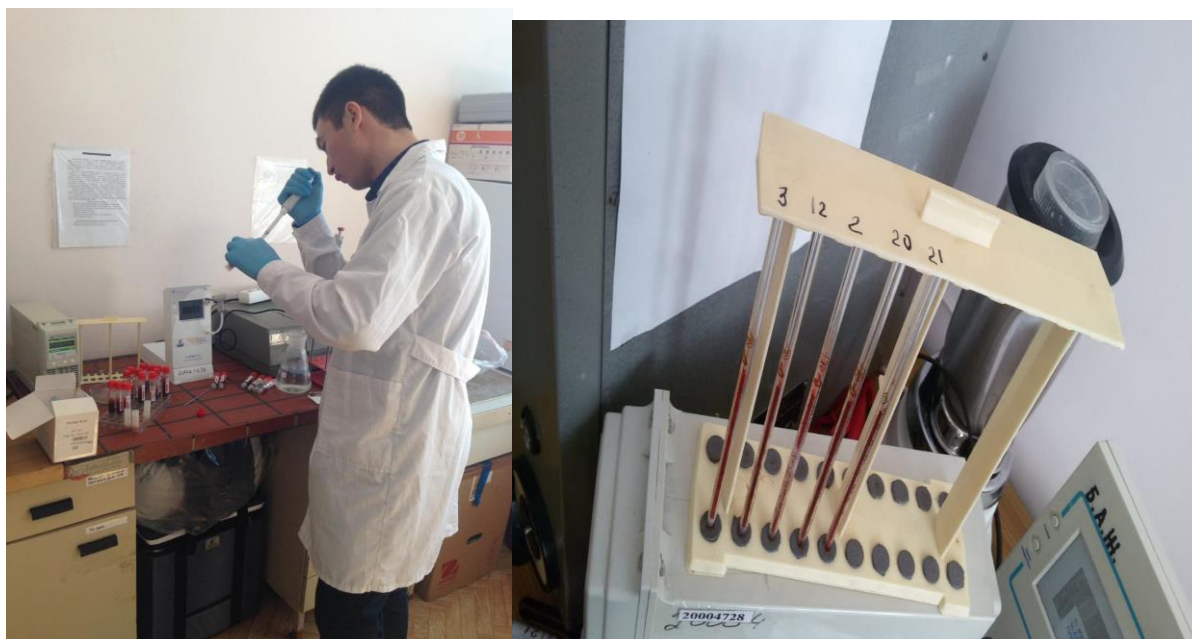
Figure 1 – Course of blood serum decoupling and determination of erythrocyte sedimentation rate

The obtained results of hemotological indicators of blood serum of heifers and bulls are presented in Table 1.